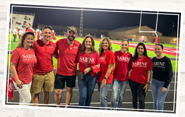
Sabine FCU joins the fun at Bridge City High School Football Night!