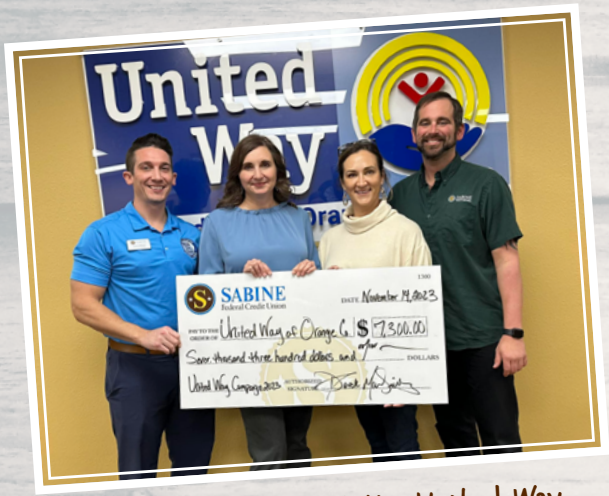
Sabine FCU presented the United Way of Orange County a check for $7,300.00 of funds raised during our campaign this year!