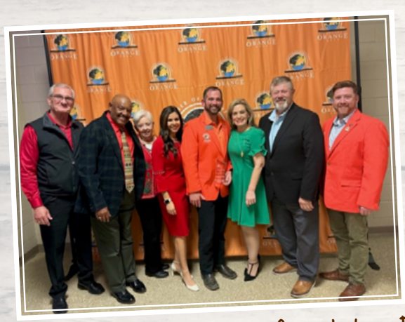
Sabine FCU at the West Orange Stark High School Homecoming Parade!