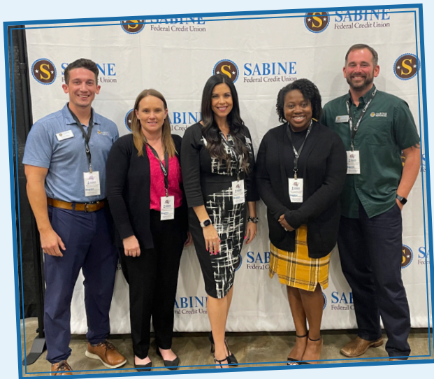
Sabine FCU was a vendor and attended the BBB of SETX Professional Women's Conference.