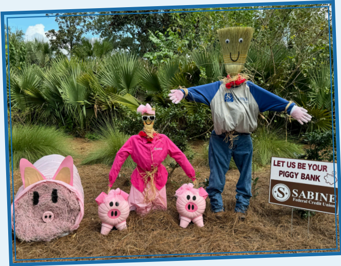
Sabine FCU participated in the annual Scarecrow Festival with Shangri La Botanical Gardens.