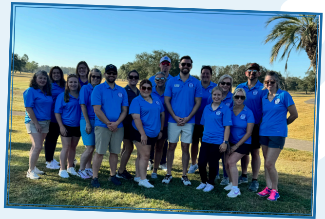
Sabine FCU participated in the Sabine Chapter of Credit Unions 32nd Annual Kids Classic Golf Tournament benefiting the Children's Miracle Network in Southeast Texas!