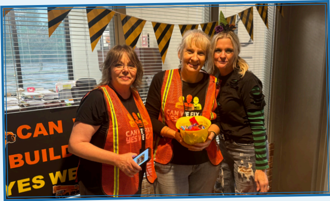
Sabine FCU hosted Trick or Treat at our Strickland Drive office for our Youth Club members!