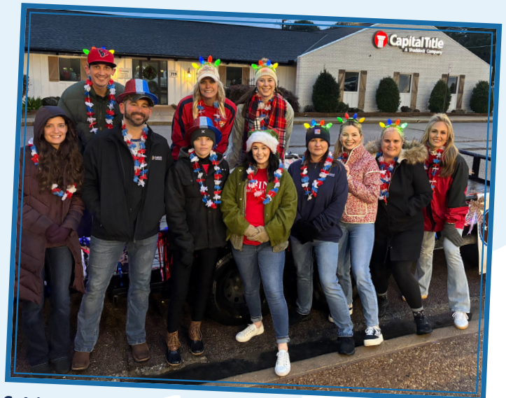
Sabine FCU participated in all local Christmas parades. We placed 3rd in the Bridge City Parade.