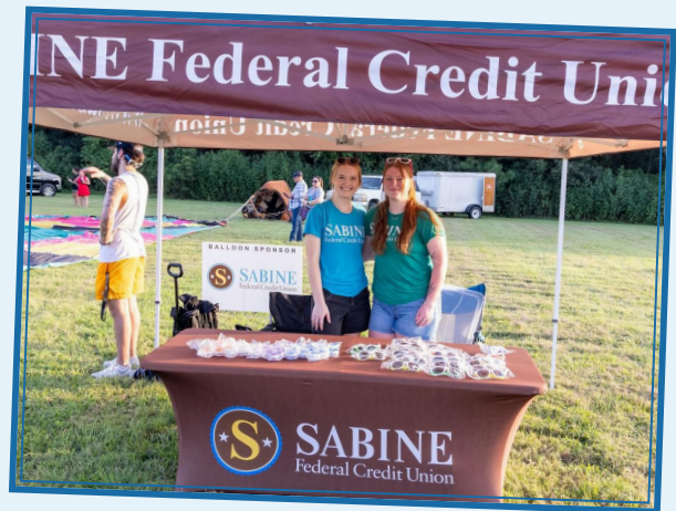
Sabine FCU was a sponsor and participated in the first annual Bridge City Hot Air Balloon Festival.