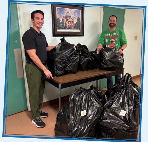
Sabine FCU adopted and provided Christmas for seven kids through Orange Christian Services.